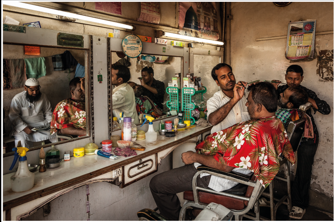
Frizer / Hairdresser