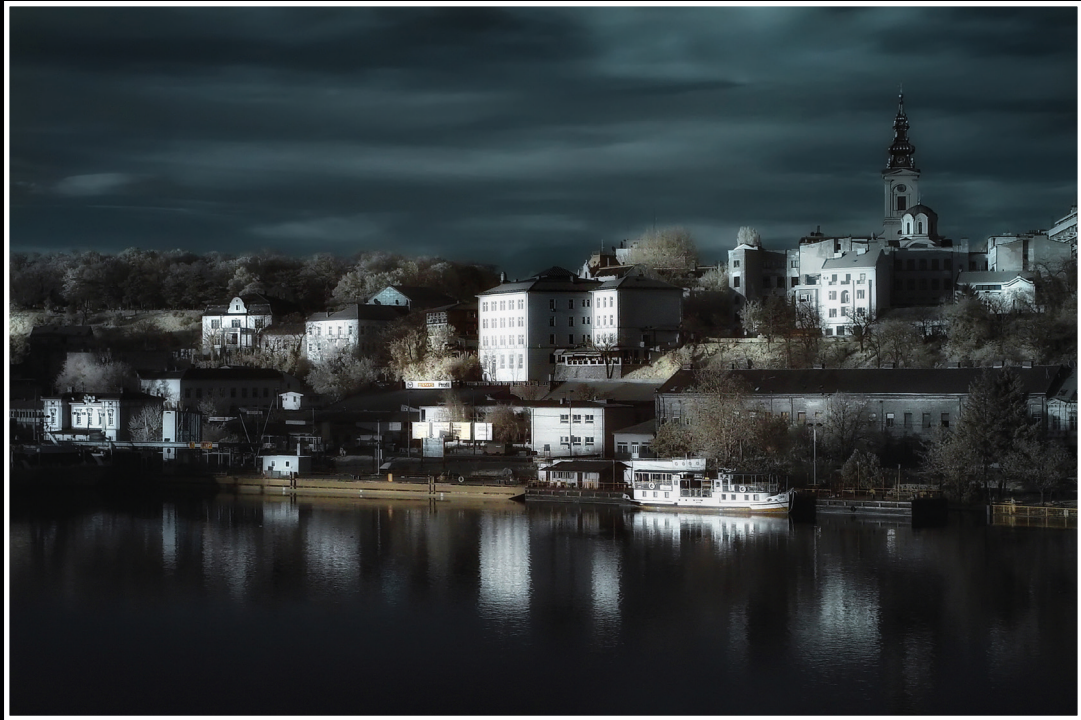
Beograd / Belgrade