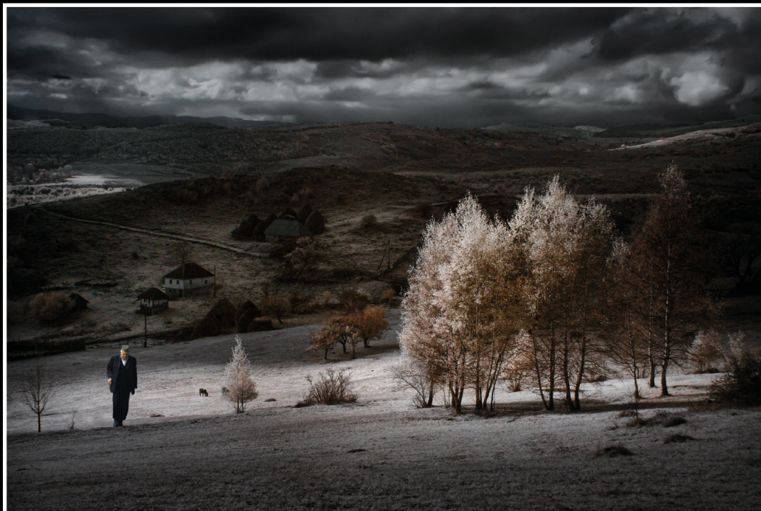
Oddaljena hiša 1 / Distant house 1