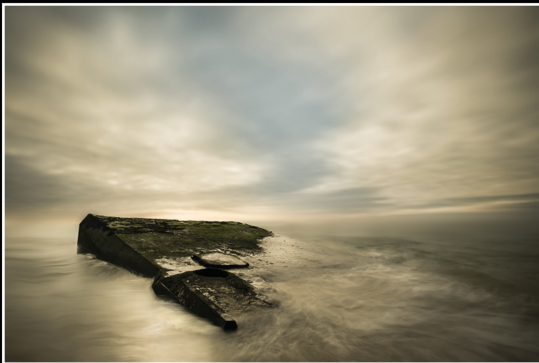
Sanjska dežela 25 / Oniric desires 25