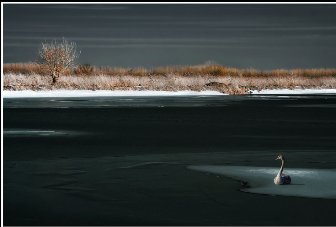
Zamrznjeno jezero in labod / Icy lake and Swan