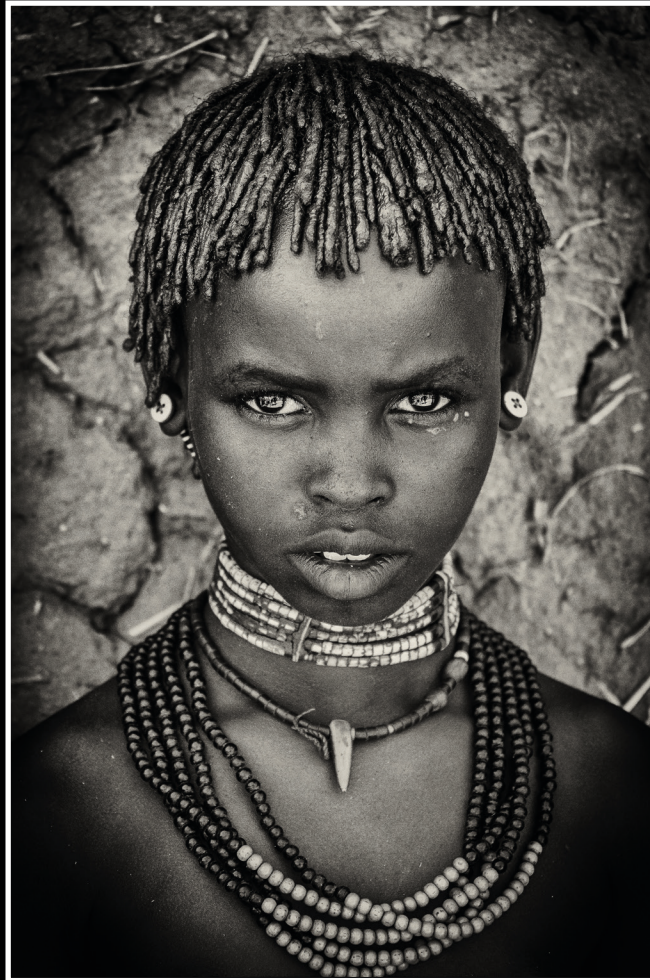
Deklica iz plemena Karo / Young Karo girl