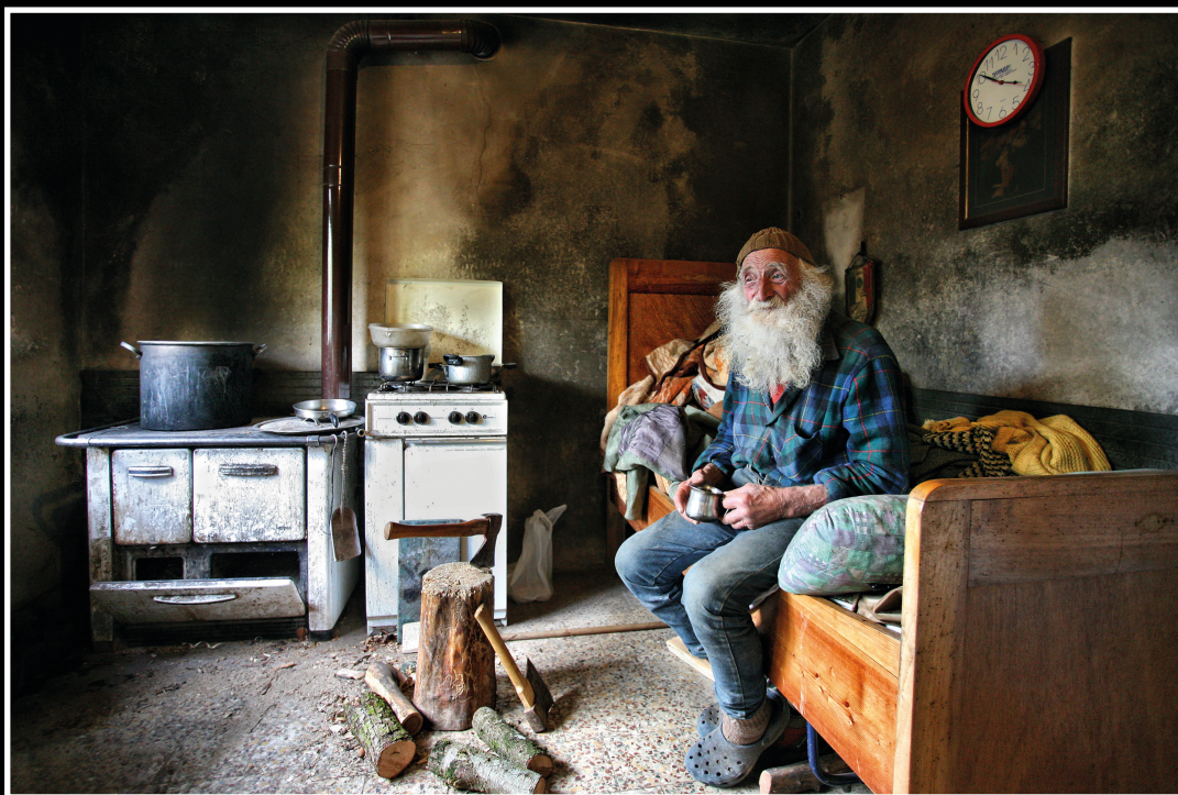
Beppinov svet / The world of Beppino