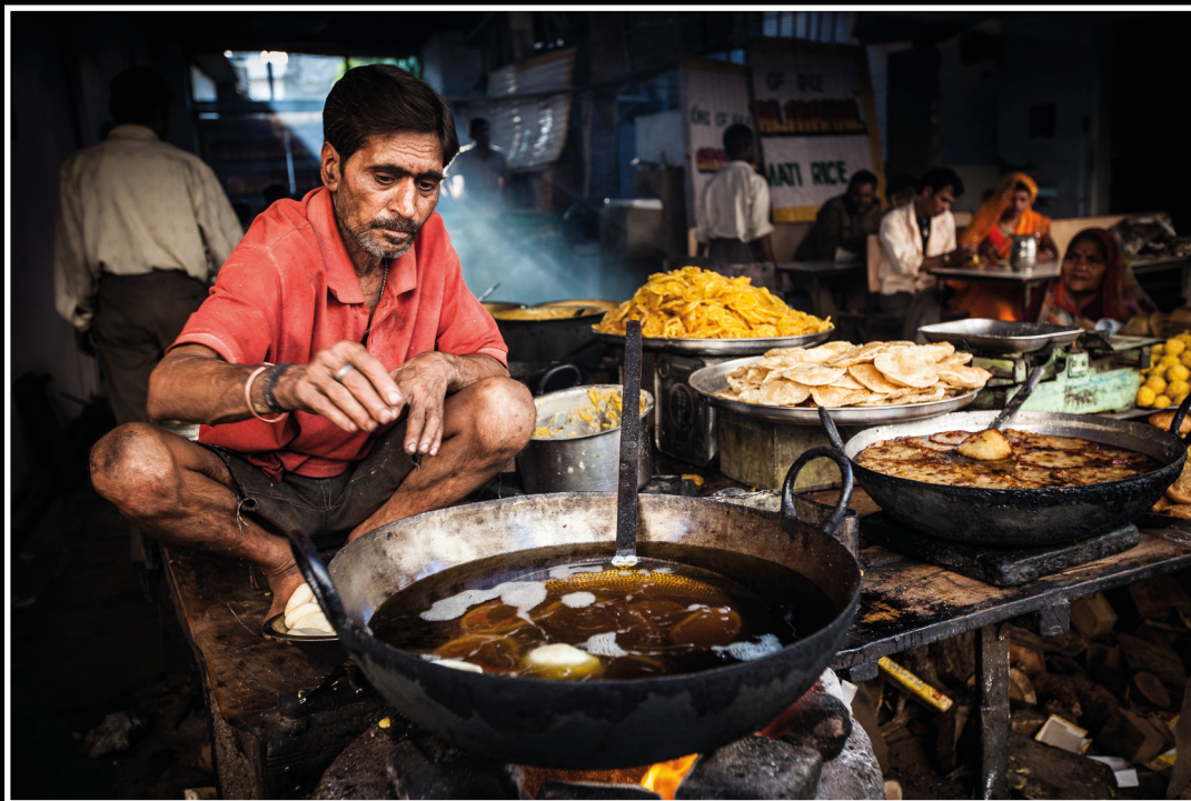
Cvrtje na ulici / Frying on the street