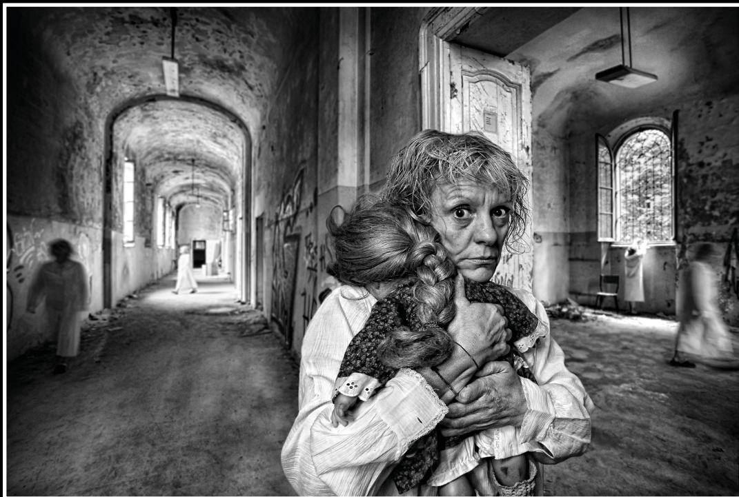
Ujetnik preteklosti / Prisoner of the past