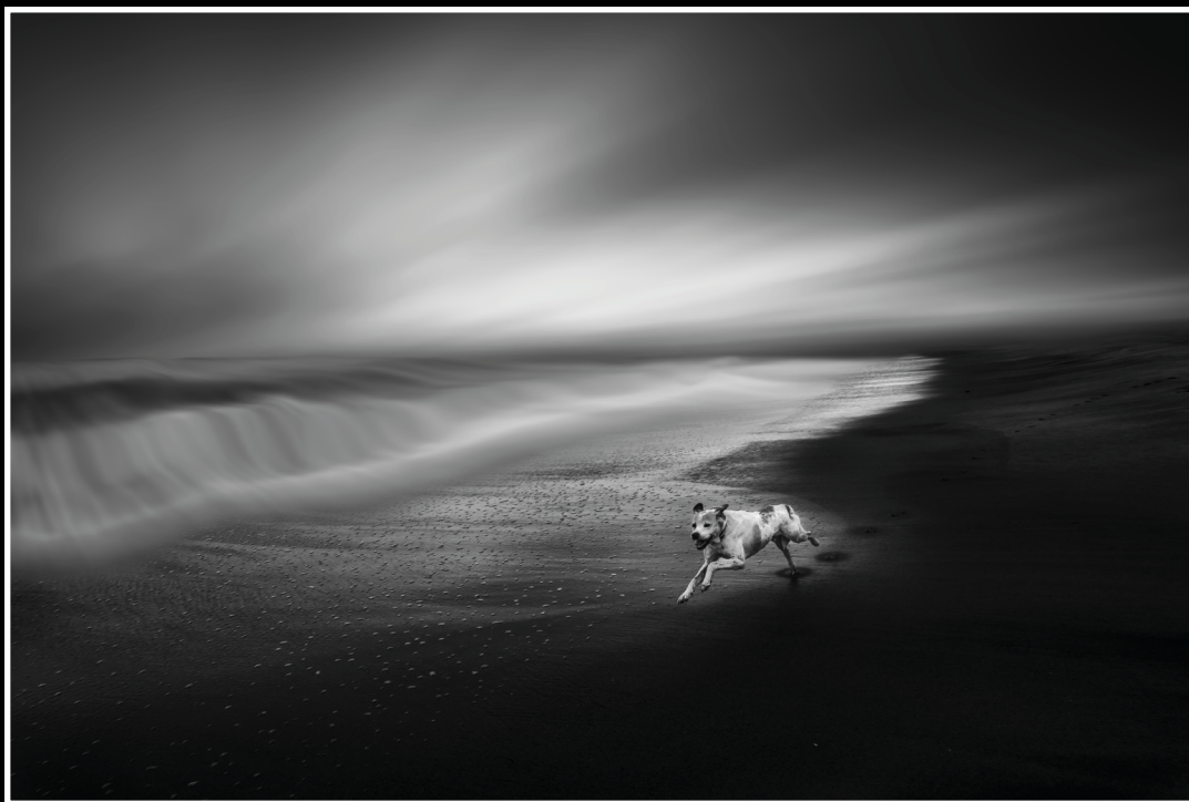
Sanjska dežela 14 / Oniric desires 14