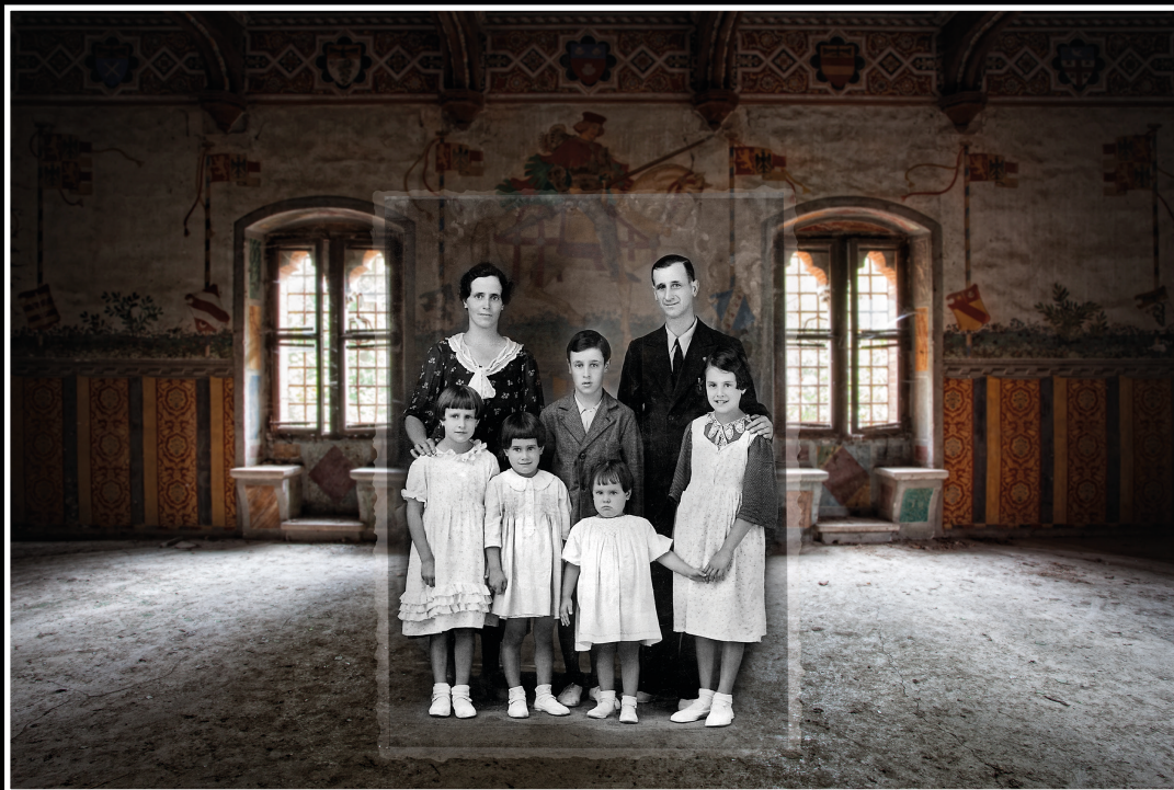
Družinski album 1 / Family album 1