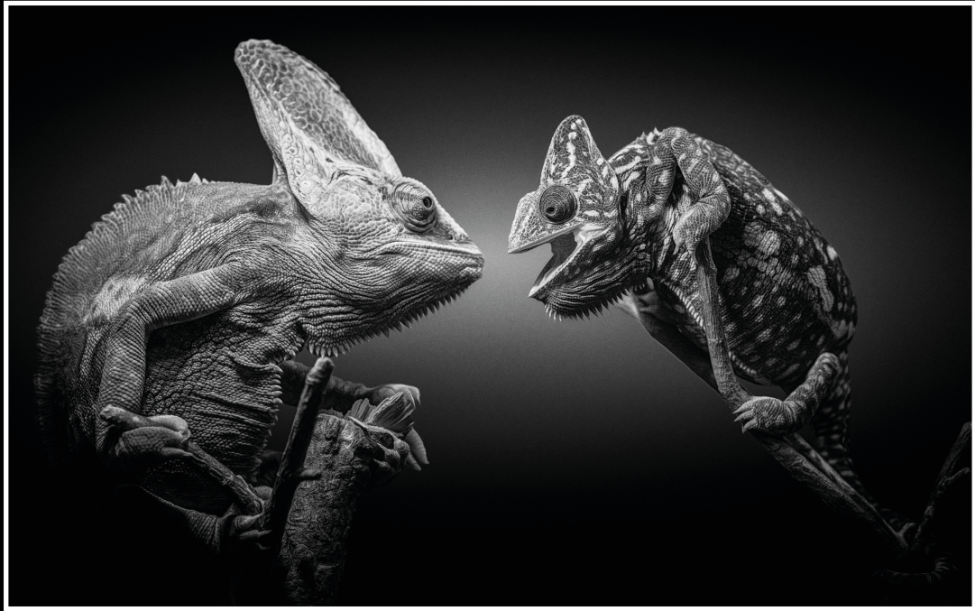
Pucher Michaela / Klepet / Chat